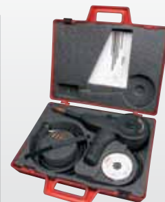
Aluminium kit K2532-1