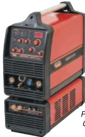
Pictured with Cool-Arc 20